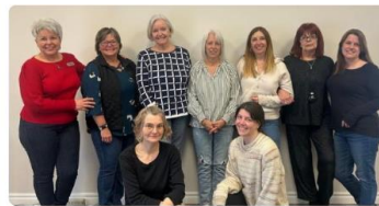
MV Hospice Palliative Care $52,185

A portable x-ray machine, rovers for mobile charting, bariatric bed and mattress, Hovermatts, ceiling lifts and motors, and more.