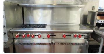
Valley Manor Long Term Care $34,854

Program support including volunteer training, caretaker and bereavement assistance, and more.