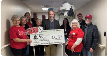
St. Francis Memorial Hospital $341,934

A portable x-ray machine, rovers for mobile charting, bariatric bed and mattress, Hovermatts, ceiling lifts and motors, and more.